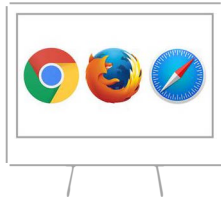
PC and Mac Chrome | Firefox | Safari